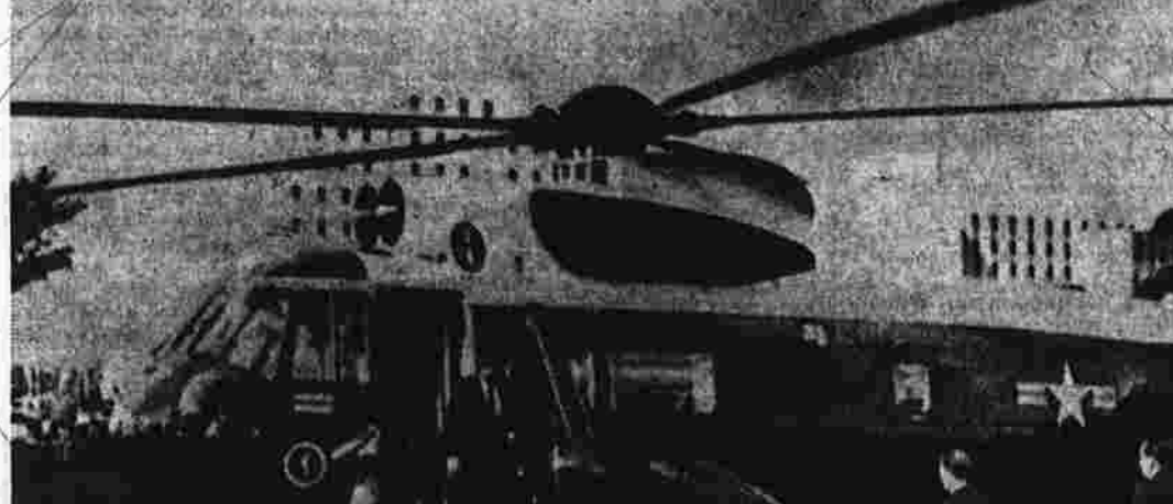
President Kennedy steps from a helicopter today in Miami where he will honor Brigade 2006, the ill-fated Cuban invasion force. Mr. Kennedy was also expected to address the assembly, speaking Spanish.

The raid on Kolwezi was carried out by Swedish-made F-105 jet fighters. It is believed that the United States made no commitment to supply the fighter planes.